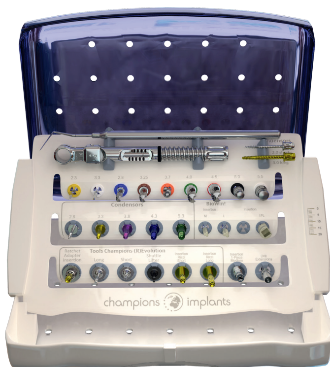
The Surgery Tray includes all necessary tools for placing titanium implants.

All Champions® implants are to be used and restored only with the original Champions® instruments intended for this purpose such as Drills, Condensers, Insertion Aids, and Screwdrivers!